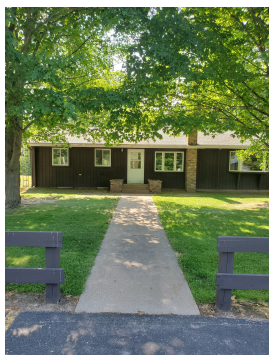
New Location of Rentals Office